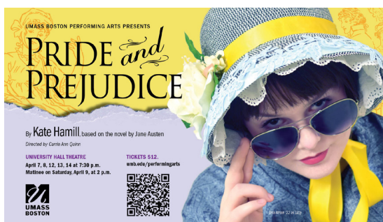
UMass Boston is performing Pride and Prejudice after a two-year delay.