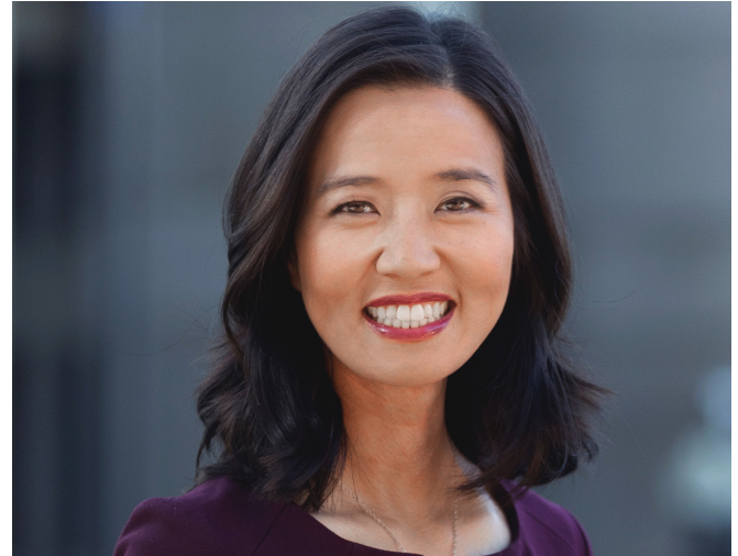
Boston Mayor Michelle Wu